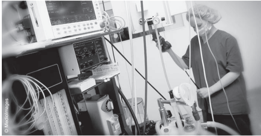
New technologies assist in the delivery of health care

Alongside the Technical Committee on Health Informatics, three new Work-