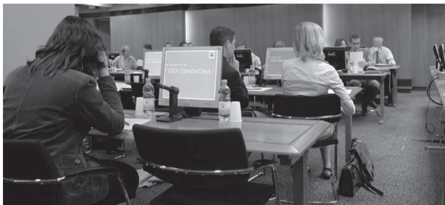
Participants listen in at CEN StandarDays

CEN will host its 3 rd StandarDays on 17 and 18 October