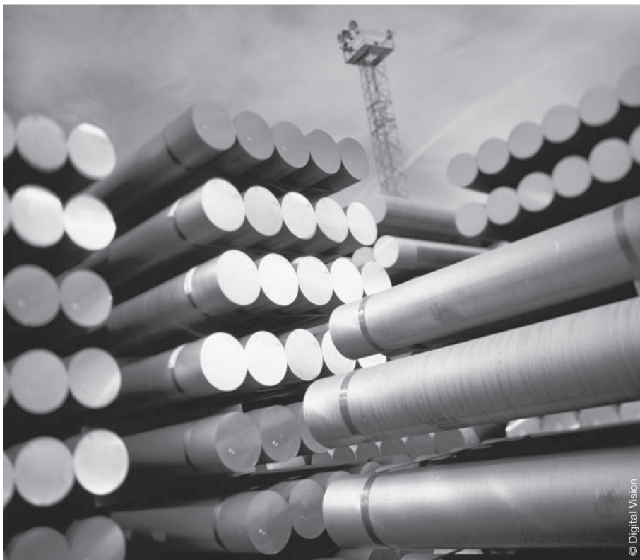
New edition of EN 573-3 applies to a wide variety of aluminium end products

Industry experts have recognized the important and urgent need for a European Standard dealing with the chemical composition of aluminium alloys and other forms of aluminium. A new edition of EN 573-3 Aluminium and aluminium alloys – Chemical composition and form of wrought products – Part 3: Chemical composition and form of products has recently been adopted that is applicable to many areas of the aluminium industry. It was initiated and supported by the aluminium industry with the aim of bringing the best information to its users. This standard gives the chemical composition of alloys series 1000, 2000, 3000, 4000,