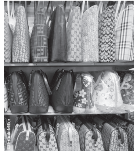
Counterfeit goods, such as these handbags, distort the marketplace

For more information on the Workshop contact barbara.gatti@cen.eu or visit www.cen.eu/issc/counterfeits .